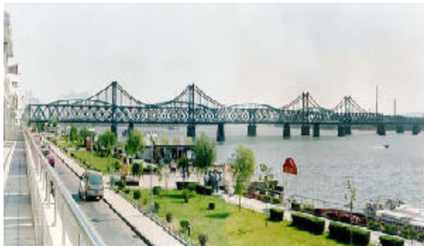
The 936-meter Friendship Bridge across the Yalu River joins Dandong in China with the city of Sinuiju in North Korea.

Dandong City is part of the large Dandong Prefecture, which is home to 2.4 million people.