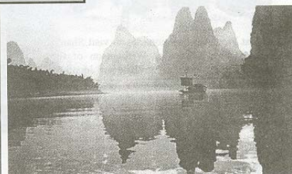
The beautiful Three Gorges area near Fuling.

Emperors, presidents and Communist officials have dreamed about controlling the flow of the Yangtze, something that has only recently become technically possible. Quite simply, the Three Gorges Dam is one of the largest projects ever undertaken in the history of mankind. The dam will create a reservoir 650 km (400 miles) long and 186 meters (610 feet) high, permanently submerging 150,000 acres of