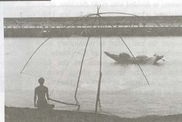
Thousands of families in Honghu earn their income by fishing.

Honghu means 'Flooding Lake'. The city is flanked by the Honghu Lake to the west and the mighty Yangtze River on the eastern side. For centuries the Yangtze has