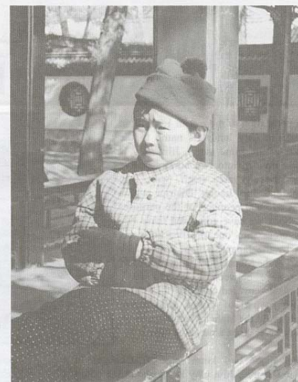
The Chinese in Hubei Province are renowned for being aggressive and stubborn people. Only about 0.4% of the people in Honghu City have bowed their knee to Jesus Christ.