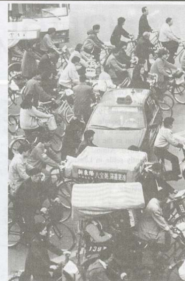
Jingmen is home to 1.5 million souls for whom Christ died and wills that none would perish. Who will go and proclaim the day of Salvation has come?

Today, only about 0.4% of the people in Jingmen claim to know Christ. Most people in the city have never even heard His Name.