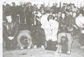
Rural believers in Hunan Province.

Missionary work in Hunan was very fruitful, until the Communist Party came to power. They methodically went through the towns and villages, purging Christians from among the people. Thousands were killed for their belief in Christ, while many others renounced their faith. Scores more were sent to labor-camps to be "re-educated", some for 20 years or more. Although the church in Hunan is once again growing, there are deep schisms among churches and the presence of Chinese indigenous cults has taken a great toll on the believers. Today, as many as 90% of believers in the province live in the countryside. The cities, including Lianyuán, almost seem to be devoid of Christianity.