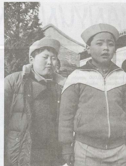
Hunan Province is the home of Mao Zedong. Consequently, the church faced massive persecution after 1949. Today, cities like Lianyuán have very little Christian presence. Few have ever heard the Gospel.