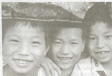
Over 30% of people in Lianyuán are aged under 15 years-old.

Hunan is sometimes called Ch'u as a nickname. The powerful kingdom of Ch'u was based in the province until it was