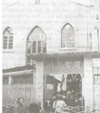
The Liuzhou Christian Church on Weixin Lane.

Because of its former small population, Liuzhou was not considered an important target for missionaries prior to 1949. Most of the believers in the city today are immigrants who have brought the Gospel with them from other parts of Guangxi. The vast majority of the people of Liuzhou, however, have never heard the Gospel before in their lives.