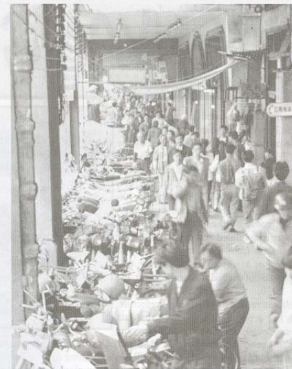
Liuzhou has quickly become a crowded, bustling city of more than 1.1 million people. Less than one percent of the city's inhabitants profess to follow Christ.