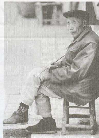
An elderly man sitting on his stool in Mianyang. There is a somewhat tense atmosphere in Mianyang, due to conflict between workers and corrupt officials.

Anglican (Church of England) and China Inland Mission workers lived in Mianyang prior to 1949, opening hospitals and schools. Today, there are believed to be approximately 8,500 followers of Jesus in Mianyang City, including more than 600 associated with the former Anglican church. Although this city-wide figure represents less than one percent of the population, more than a decade ago there were very few evangelical believers living in the 2,100 year-old city.