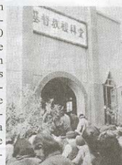
Believers arriving for worship at Mianyang Church.