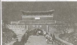
The 'Last Gate Before Heaven', located at the top of Taishan Mountain.

mountain, which rises 1,545 meters (5,067 feet) above Tai'an City. There are numerous religious temples, idols and structures on Taishan, in addition to pools, lakes, rock formations and ancient bridges.