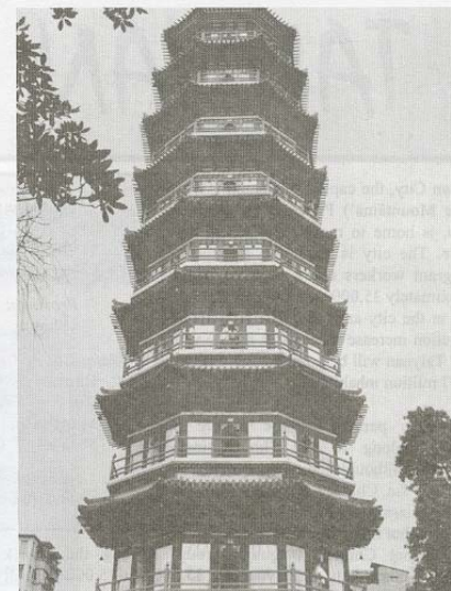
Tai'an and Taishan Mountain are home to countless Buddhist, Daoist and Confucian temples and pagodas which date back many centuries. Fewer than 1% of the city know Jesus Christ.