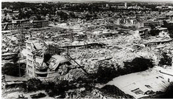
The 1976 Tangshan earthquake flattened the city and killed at least a quarter of a million people.

Today Tangshan has been completely rebuilt and