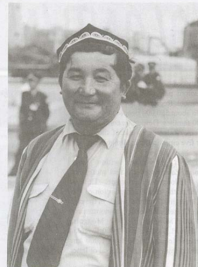
The Uzbeks are one of a dozen unreached people groups in and near Yining. These Muslims help give Yining a Central Asian flavor. The Han Chinese comprise only one-third of the city's population.

Today, there are just a few small Han churches in Yining among the entire population. Because of racial prejudice, the Muslims are not usually able to receive the Gospel from a Han. As a result, most Christians in the area consider the Muslims impossible to reach and so do not even try to witness to them.