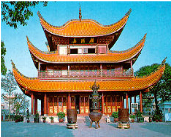
The 1,300 year-old Yueyang Tower

The economy in Yueyang is based on factories, fishing, and farming. Rice, cotton, oil, lotus, poul-