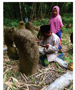
Graves of Allu Ancestors