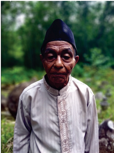
One of Allu Leaders