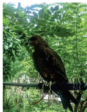
Eagle at the house