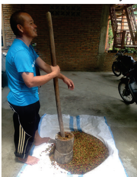
Grind coffee traditionally

The area needs economic development for the Allu to advance. They do not yet have many local businesses that are uniquely Allu to strengthen the community's economy. (RD)