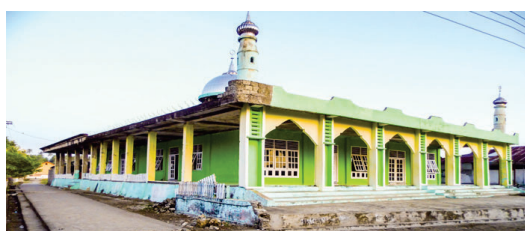
The first mosque in Patani

The relationship between Muslim and Christian groups in this area continue to be under strain as a result of past conflict. (RD)