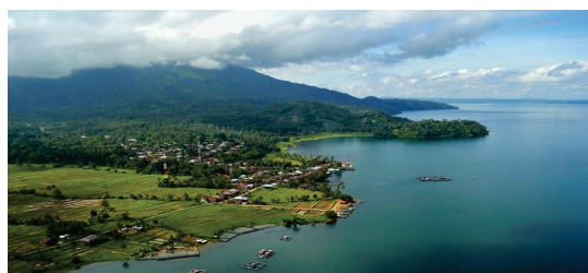
The Beauty of Ranau Lake