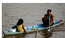
River is the central live of the Sanggau Sekadau