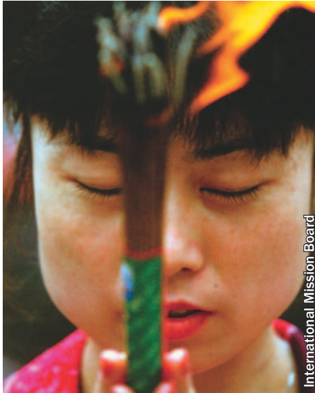
International Mission Board

In September 1807, Robert Morrison landed in Guangzhou. A new era of Protestant missions began in China. Seven years later he baptized his first convert, 'At a stream of water issuing from the foot of a lofty hill, far away from human observation. . . . May he be the first-fruits of a great harvest.' 5 Today there are at least two million Cantonese Christians in China, and another 500,000 living in nations around the world.