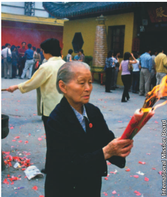
International Mission Board

Missionaries have worked among the Min Dong for more than 160 years. They translated Scripture portions into Min Dong in 1852, followed by the New Testament in 1856 and the entire Bible in 1884. Today there are at least 500,000 Min Dong believers in China, including more than 100,000 in Fuqing County alone. 6 An additional 100,000 Min Dong-speaking Christians live in Southeast Asia.